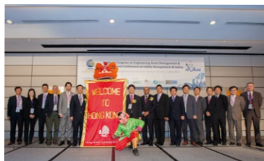
• 3rd International Conference on Utility Management & Safety 2013