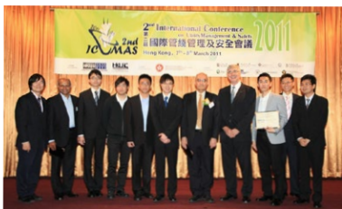
• 2nd International Conference on Utility Management & Safety 2011