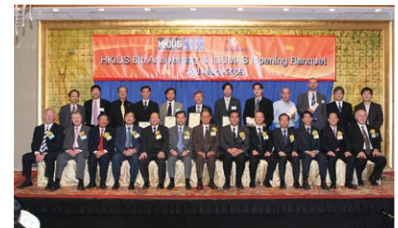
• HKIUS 1st ICUMAS 2009