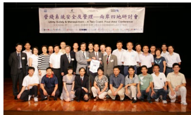
• 2007 Utility Safety & Management Conference