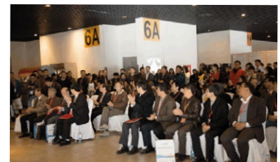
• The 4th International Conference on Utility Management & Safety (ICUMAS) Summit & China International Underground Pipeline Exhibition & Conference 2014