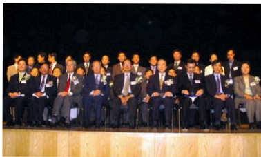
• 2003 Open Forum at Hong Kong Polytechnic University

Our theme for ICUMAS 2017 is "Control & Utility Management and Safety for Smart City and The Sponge City" "智慧城市及海綿城市的控制與管綫管理及安全".