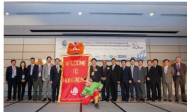
• 3rd International Conference on Utility Management & Safety 2013