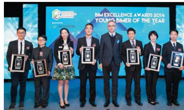
• CIC's BIM Excellence Awards 2014 - Young BIMer of the Year