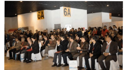
• The 4th International Conference on Utility Management & Safety (ICUMAS) Summit & China International Underground Pipeline Exhibition & Conference 2014