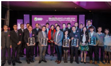
• CIC's BIM Excellence Awards 2014 - Construction Innovator by BIM