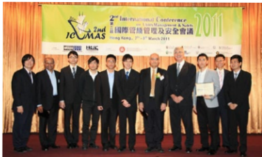
• 2nd International Conference on Utility Management & Safety 2011

Building Information Modelling (BIM) is a new tool to manage information relating to asset creation and asset management. It is a new way of working using new technology to facilitate project management, construction process control, cross-disciplinary collaboration, stakeholders' communication, decision making support, productivity management, risk management, etc. "BIM in Hong Kong: What is Your Contribution?" is the main theme of the BIM Session of this Conference.