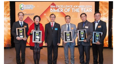
• CIC's BIM Excellence Awards 2014 - BIMer of the Year